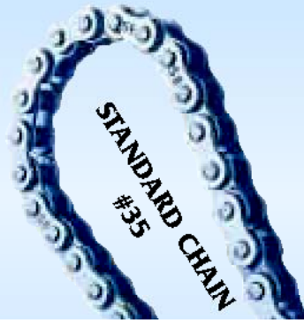
STANDARD CHAIN #35