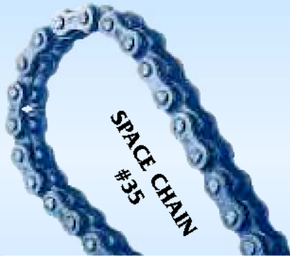
SPACE CHAIN #35